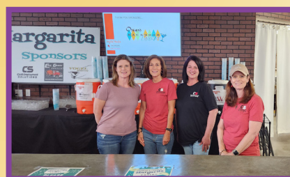
Chamber BBQ sponsorship