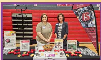
JCHS/Nichols CC Career Fair