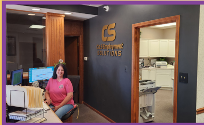
Above (L): Rebranding Ribbon Cutting; (R): Updates to front desk signage Below (L): Improvements to C&S marquee; (R) Updated entrance signage